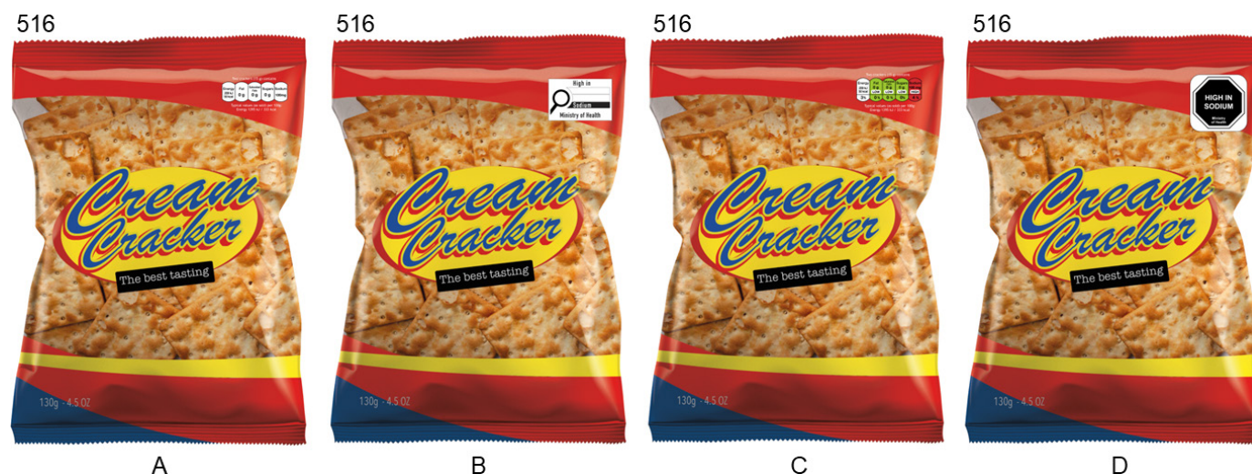
Figure 2 Example of a product from each of the FOPL groups. (A) Nutrition facts up front (control condition); (B) single icon high in FOPL with magnifying glass; (C) traffic-light labelling scheme; (D) octagonal warning label. Images developed by coauthors, Carlos Felipe Urquizar Rojas and Carla Galvão Spinillo, and designed by Carlos Felipe Urquizar Rojas and Carla Galvão Spinillo. FOPL, front-of-package labelling.

For the first task participants had four opportunities to indicate which product, out of a set of three, they would buy, or whether they would not buy any of the products, which served the estimation of the frequency with which participants intended to buy the least harmful option or none of the options. The second task also provided four opportunities for participants to identify the least harmful product, out of a set of three, and this data served the estimation of the frequency with which participants made a correct identification. The third task allowed participants