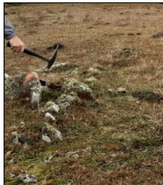
Fig. 1. Rock sampling.

About 2 kg of rock material was collected for each sample and was dried in an oven (Memmert, Büchenbach, Germany) at 40°C for 48 h. Once dried, they were crushed using a Denver N°2 jaw crusher to reduce the particle size to less than 6 cm and after that using a Fritsch Pulverisette 1 (Fritsch, Idar-Oberstein, Germany) jaw crusher with tungsten carbide jaws, the particle size was reduced to less than 1 cm. Following, samples were divided using a sample splitter and approximately