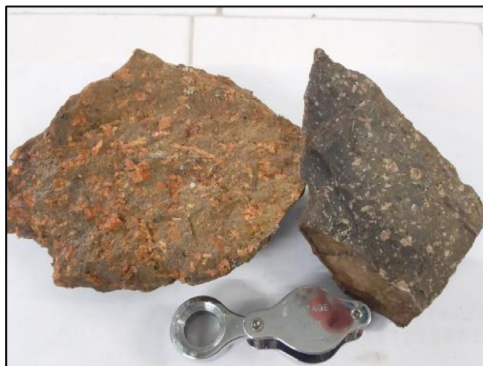
Fig. 2. Samples from Valle Chico dykes.

200 g were pulverized with an agate ring mill, Jurgens Siebtechnik TS 100A (Siebtechnik, Mülheim, Germany) for 15 min to obtain a final particle size of an 85% of distribution less than 125 \mu\text{m} .