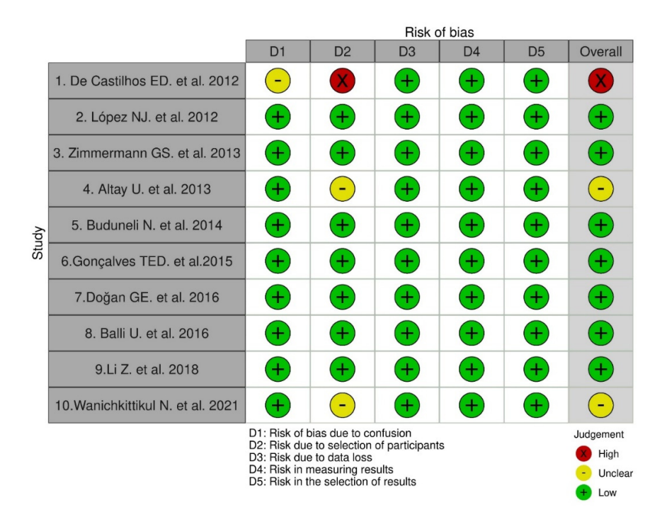
Figure 2. Risk of bias for each of the articles included.