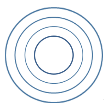
Figure 4. Concentric circles to illustrate different combinations of systems and surroundings.

Prior to instruction, we asked students about their previous knowledge of thermodynamics and thermodynamic universe (system, frontier and surrounding). After instruction, we asked the students to describe the three components of the thermodynamic universe using the painting and a simplified representation of concentric circles (Figure 4), and to explain how many thermodynamic universes they identified from the representations.