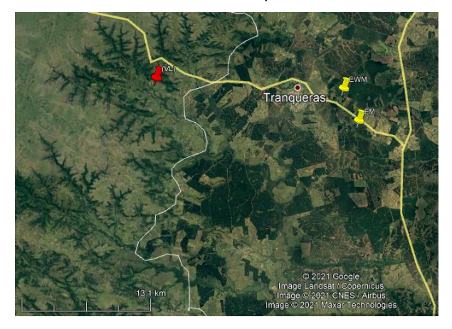
Figure 1. Location of the 3 apiaries in the northeastern region of Uruguay. Limit between two systems, afforestation and protected area

origin, in addition to controlling the techniques applied in the apiary (cures, feeding, etc.)<sup>(11)</sup>.