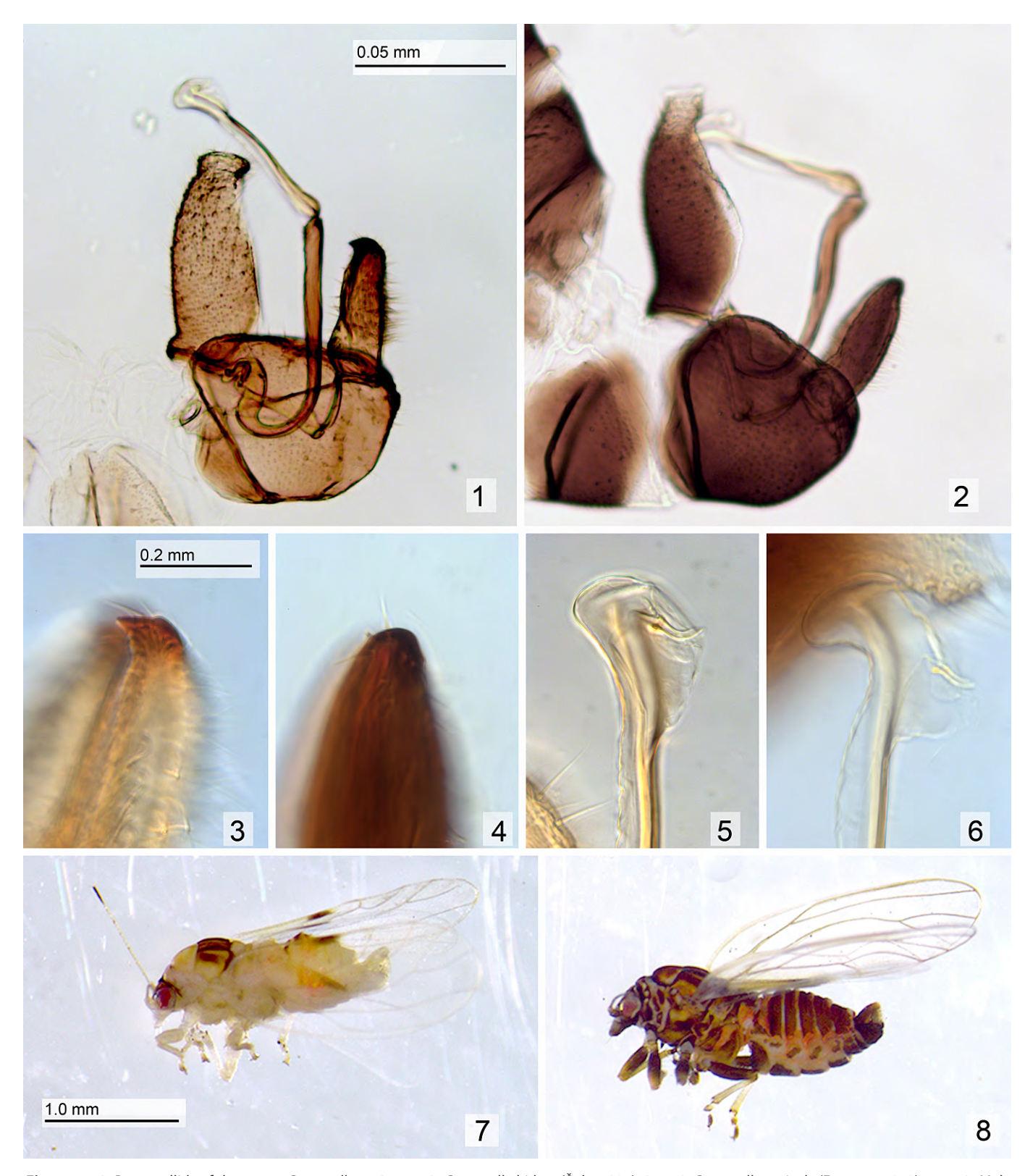
Figures 1–8. Pear psyllids of the genus Cacopsylla . 1, 3, 5, 7, 8: Cacopsylla bidens (Šulc, 1907); 2, 4, 6: Cacopsylla pyricola (Foerster, 1848). — 1, 2: Male terminalia in lateral view (scale bar Fig. 1); 3, 4: apical portion of paramere (scale bar Fig. 3); 5, 6: apical dilatation of distal portion of aedeagus (scale bar Fig. 5); 7: summer form; 8: winter form (scale bar in Fig. 7).

genal processes and female terminalia (Table 1). The immatures of the two species are similar and no stable characters are known to separate them. The paramere of C. bidens (Figure 1) is, in lateral view, slightly shorter and thicker than that of C. pyricola (Figure 2), and bears two characteristic teeth apically (Figure 3), rather than