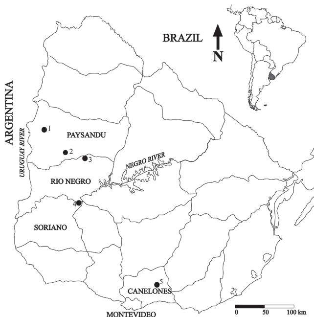
Figure 1 Map of Uruguay showing the locations where the species was found. 1 Quebracho, Paysandú; 2 Piedras Coloradas, Paysandú; 3 surroundings of Algorta Town, Río Negro; 4 Palmar, Soriano; 5 Sauce Solo, Canelones.

Geographic and stratigraphic occurrence Sauce Solo (Canelones Department); surroundings of Algorta Town (Río Negro Department); Palmar (Soriano Department); Piedras Coloradas and Quebracho (Paysandú Department), Uruguay (Fig. 1). Queguay Formation, Late Cretaceous.