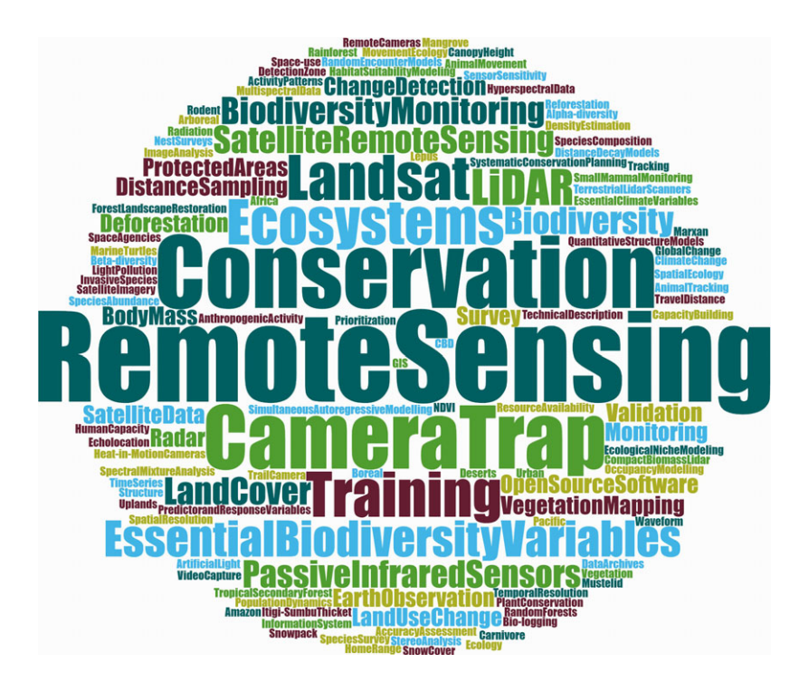
Figure 2. Keyword wordle, based on the keywords used by authors to describe their contributions published in Remote Sensing in Ecology and Conservation .

Our citations records for these contributions are equally strong given our young history. According to Scopus, our 2015 and 2016 papers have so far been cited 63 times (or 133 times according to Google scholar) in 37 peer reviewed journals, including Methods in Ecology and Evolution, Journal of Applied Ecology, Biodiversity and Conservation, Remote Sensing of Environment, Progress in Physical Geography, Ecology and Current Opinion in Environmental Sustainability. Interestingly, our most popular contributions have by far been Policy Forums and Interdisciplinary Perspectives, with one Perspective and a Policy Forum published in late 2015 cited over 10 times by the end of March 2017. It is important at this stage to acknowledge that Scopus has a different coverage to Clarivate Analytics (who produce impact factor scores), and that the numbers presented relied on specific data requests, which means that some citations may have been